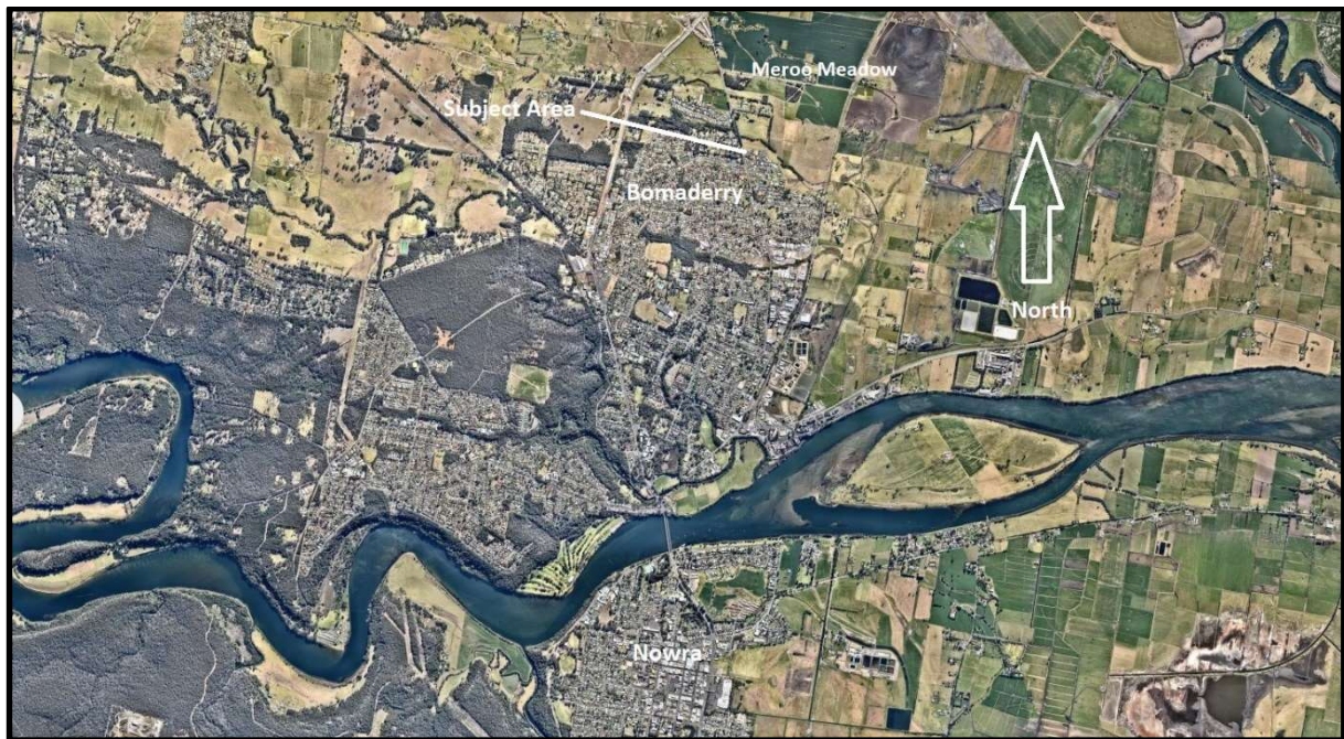
Figure 3 Location Map

The subject site is located approximately 5km North of the Nowra CBD and is surrounded by residential uses to the west and south and rural uses to the north and east (Figure 3).