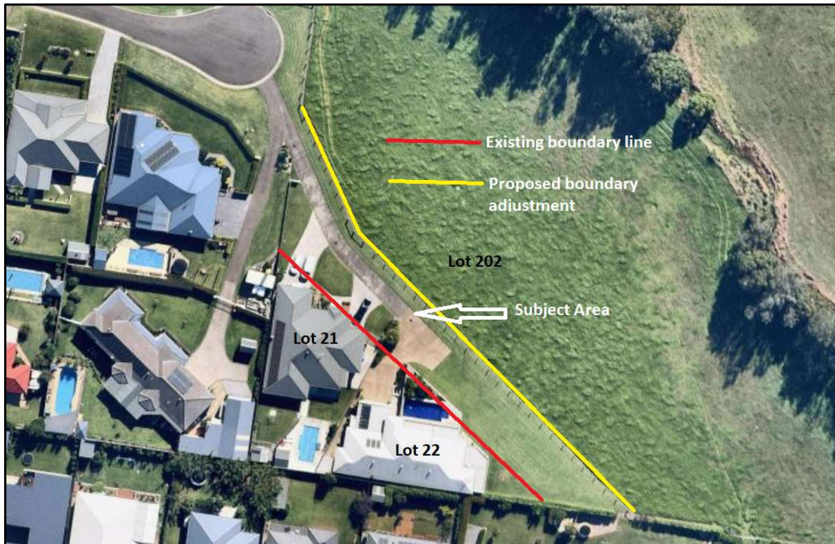
Figure 1 Aerial Photo